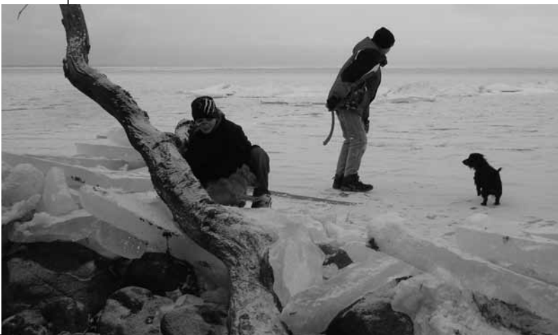
Youth and dogs enjoy the frozen lake.

If you can give Audubon some time and help, then we will be able to continue the seed sale. Please contact Diana Beck at 922-7931 or dbeck7931@charter.net .