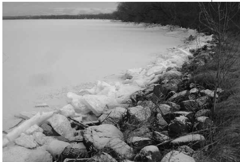
Ice chunks along the Lake Winnebago shoreline.