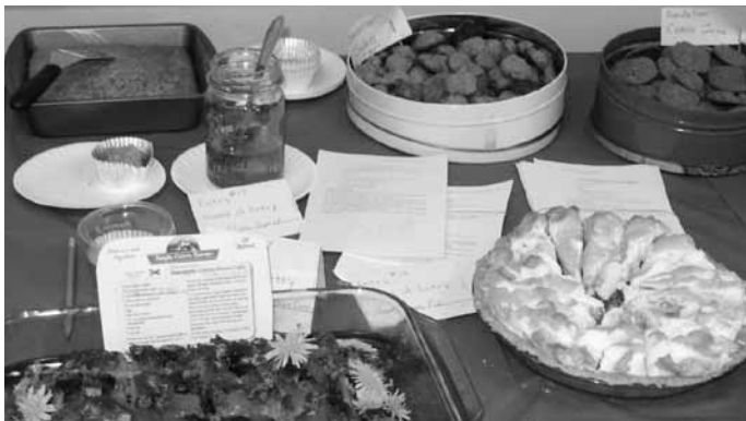
Dandelion recipes from the 2011 contest.