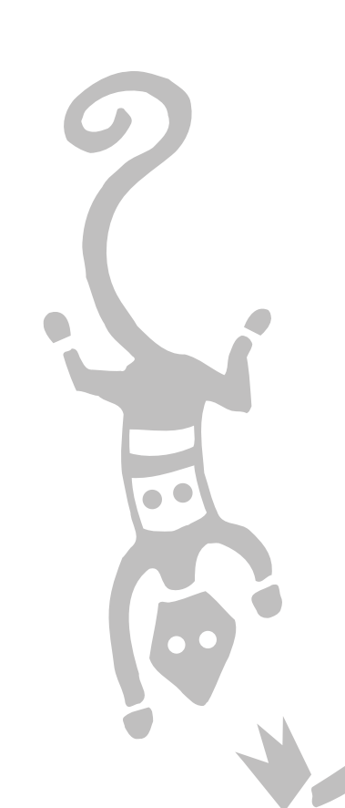
Visit Us On the Web: www.fdlaudubon.org